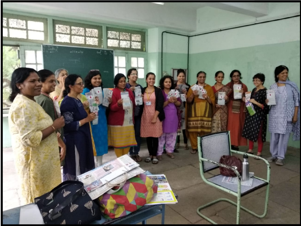
PHOTOGRAPH OF PINK POUCH ACTIVITY